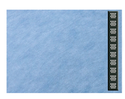
Step 1 A