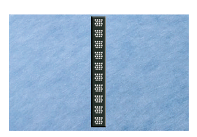
Step 1 B

Center of drain hole should be 2-1 / 4" from expected finished wall surface.